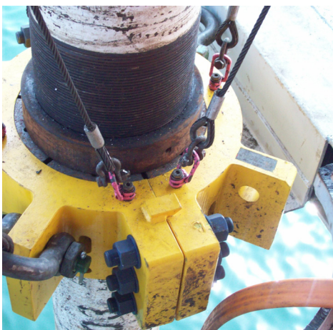
SUREGRIP TENSION RINGS