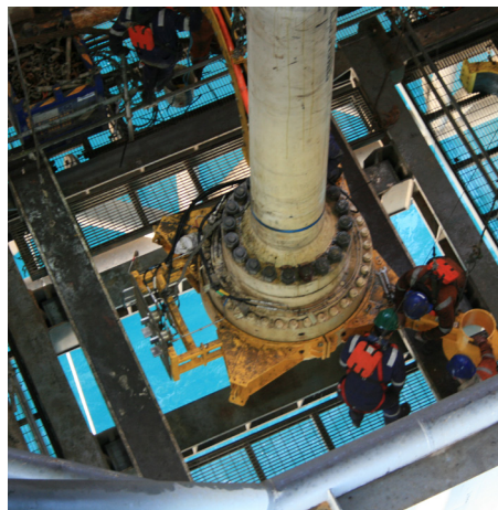
SUBSEA RISER SYSTEMS