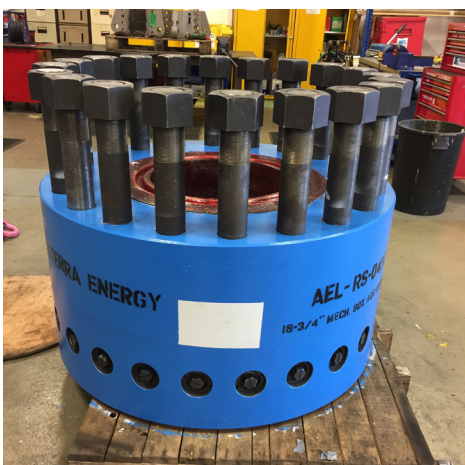
AQUATERRA QUICK CONNECTORS