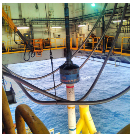
HYDRAULIC RUNNING TOOL