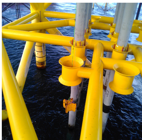
PLATFORM WELL CONDUCTOR ANALYSIS