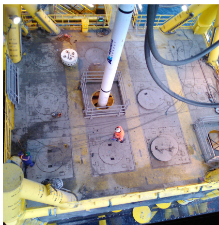
RISER MONITORING SYSTEMS